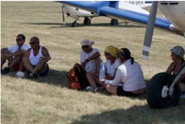
First launch postponed ...waiting in the shadow of a tow plane