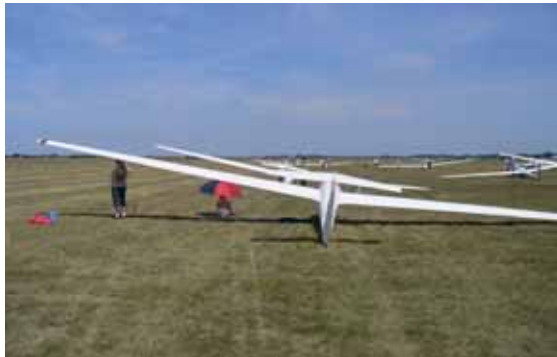
Training days : the sky was not very promising