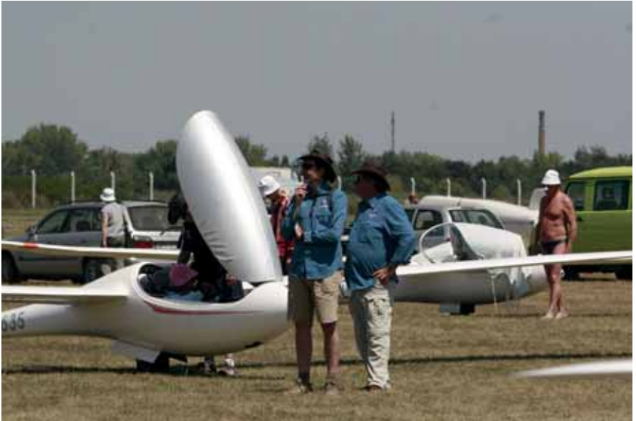
The Australian team