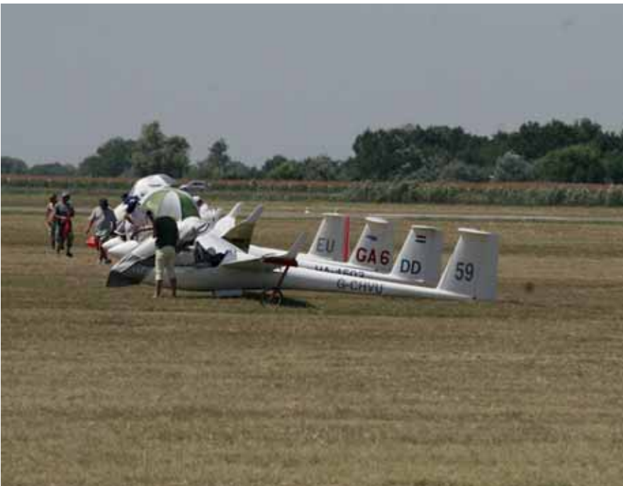
Standard class grid

In standard class “out of the way” was the silent cry of the 3 ladies strong German block Haberkern, Kussbach and Schaich , performing their 301,8 km task with 105,8 km speed average, well ahead of the CZ duo Jana Veprekova and Eva Cerna, also still more than 100 km average speed.