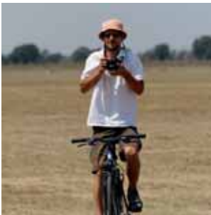
Photo Gallery man !

(what a souvenir for me, quite some years ago I had registered for a week of cloud flying training. Imagine, not one single cloud or rain drop - how dare England be so “un-British?” So instead I took an unforgettable aerobatic course).