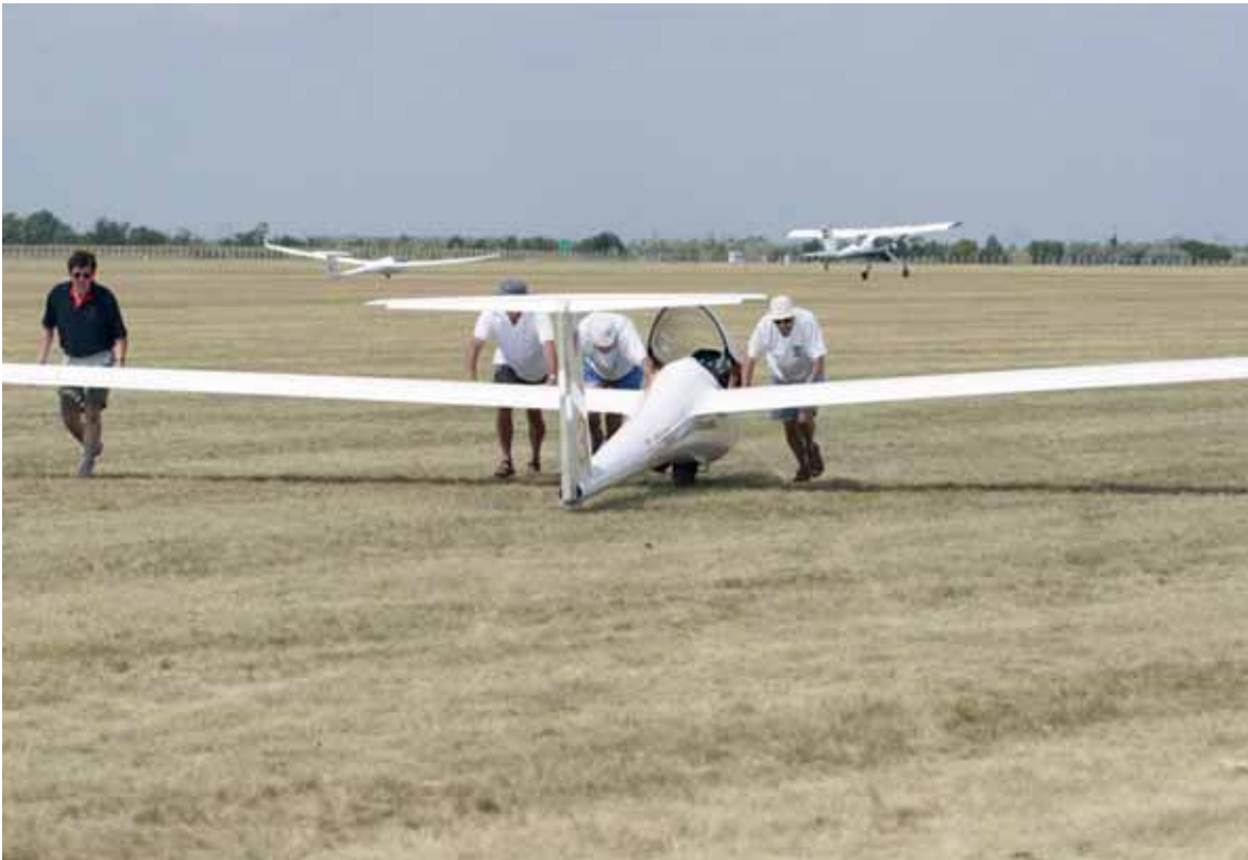
Getting ready for a second launch

For Zuzana this Day 4 meant the second 500 km in her life, whereas her average speed of 118 km/h in the racing task of 405,3 km (she finished 3 rd on Day 1) was the best speed she ever achieved in her life. Nice going, Zuzana!