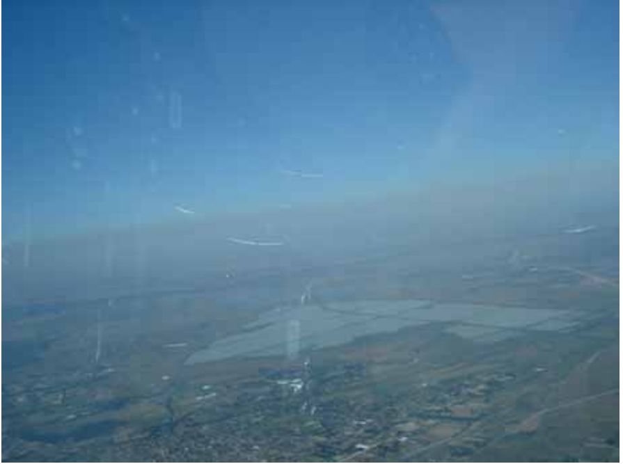
Gliders towards the first turning point, just after the start

And look, almost the same German scenario in the 15 m class with 1 (Anja Kohlrausch) - 3 - 4 - 6